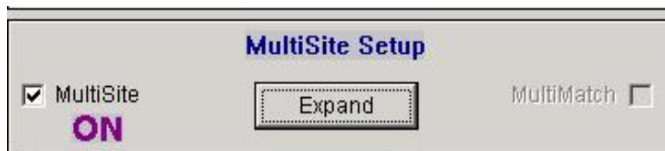
Figure 1: MultiSite Setup on the Test Setup Window

Importantly, if the user wants to modify the setup and/or vectors of an already expanded file, he needs to go into the screen of Figure 2 and press the Make Single Site button before making any modification to the test or vector setup (lest he finds himself in the tedium of making the changes multiple times). After making the changes, the above expansion process should be repeated.